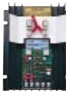
100 SSR P