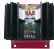
170 SSR P

Units operate at 80 to 480 VAC (600 VAC optional) at 50/60 Hz. The conservative design ensures continuous operation at full rated current in a 50°C ambient temperature (inside the enclosure).