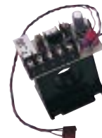
Over Current Trip